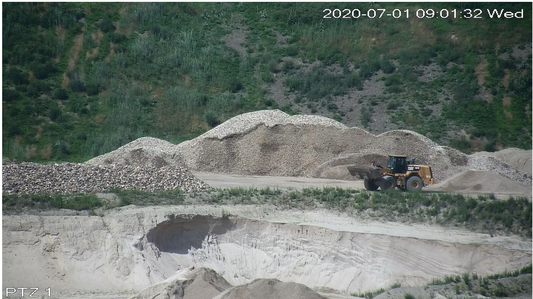
ILLEGAL MATERIAL STORED – BEING MOVED TO PROCESSING