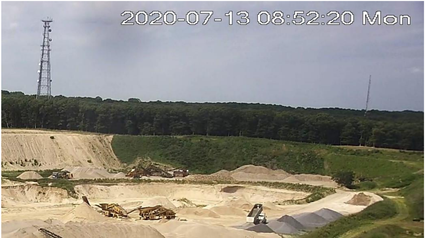
ILLEGAL IMPORTED BLUESTONE DUMPING