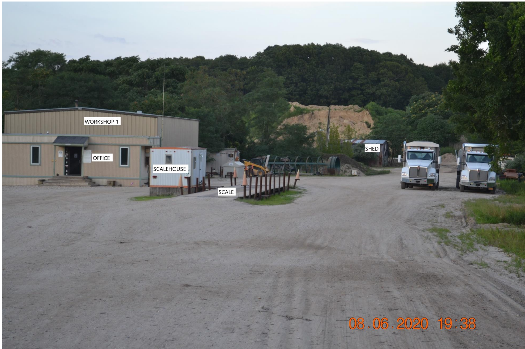
ILLEGAL BUILDINGS AS VISIBLE FROM MIDDLE LINE HIGHWAY