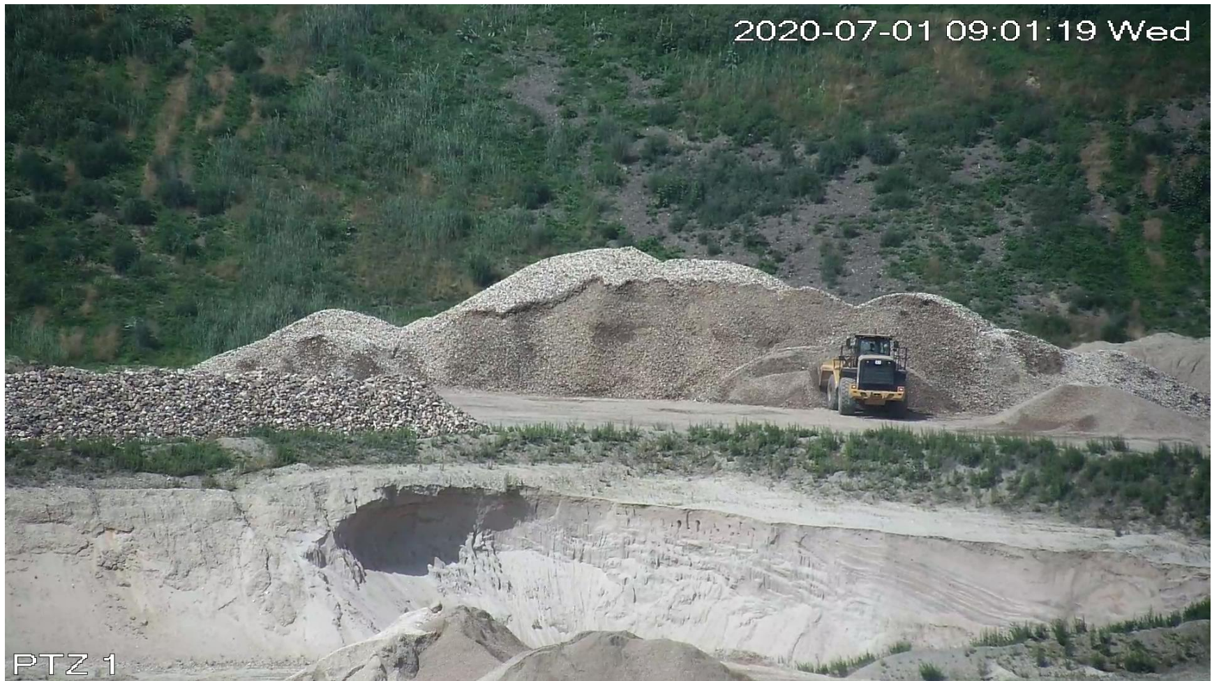
ILLEGAL MATERIAL STORED – BEING MOVED TO PROCESSING