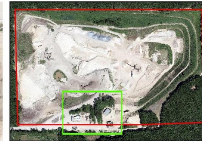
KEY MAP (1" = 500')